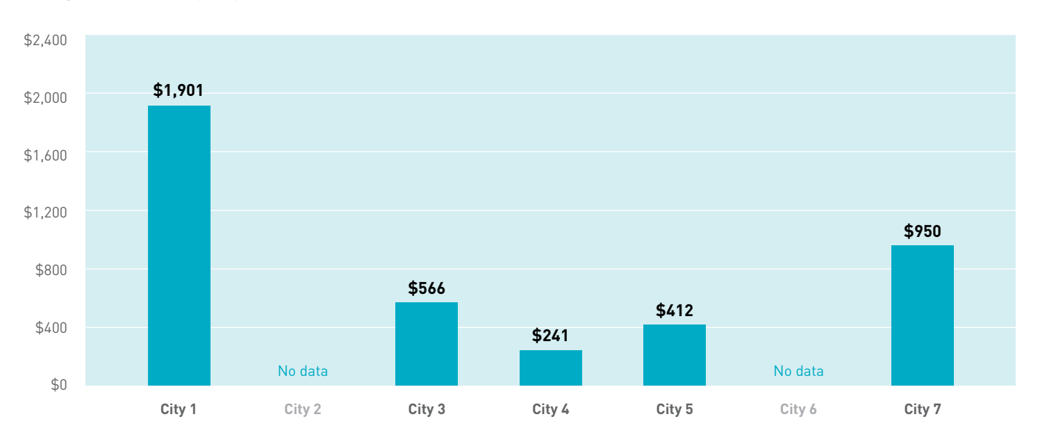
Figure 2: Average Water Debt by City

Some water debts are higher than what low-income households can realistically pay back. Average unpaid water bills ranged across the cities from $200 to almost $2,000. Some cities also had extremely high outlier debts, with some accounts reflecting over $50,000 in arrears. COVID relief funds and payment plans will be very useful for helping customers with debts in the low hundreds get back on track with their bills. But larger debts, in the thousands or tens of thousands of dollars, may be higher than what low-income people can realistically pay back, especially while continuing to pay future bills on time. The partner organizations in the pilot project shared that the communities they work with are still facing extreme financial distress related to the pandemic as shutoff moratoria lift, including continued unemployment, rent debt, and the threat of eviction. Payment plans alone—if they do not include robust debt forgiveness as an incentive—may not be sufficient to help struggling customers get up to date. Very high arrearages are often due to leaks and accumulations of punitive charges, and they can be addressed through leak abatement and debt forgiveness programs.